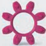
Type A Shore hardness 98 Sh A

The coupling is backlash free due to pretensioning of the elastomer insert between the two coupling halves. The Servomax-Coupling compensates for lateral, angular and axial misalignment.