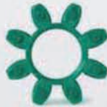
Type B Shore hardness 64 Sh D