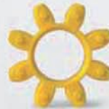
Type C Shore hardness 80 Sh A