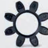
Type D* Shore hardness 92 Sh A